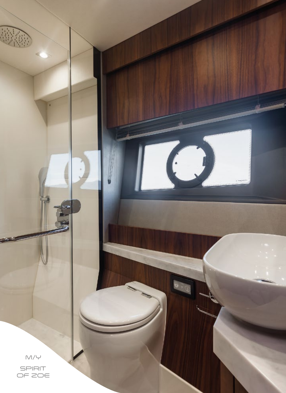
M/Y SPIRIT OF ZOE