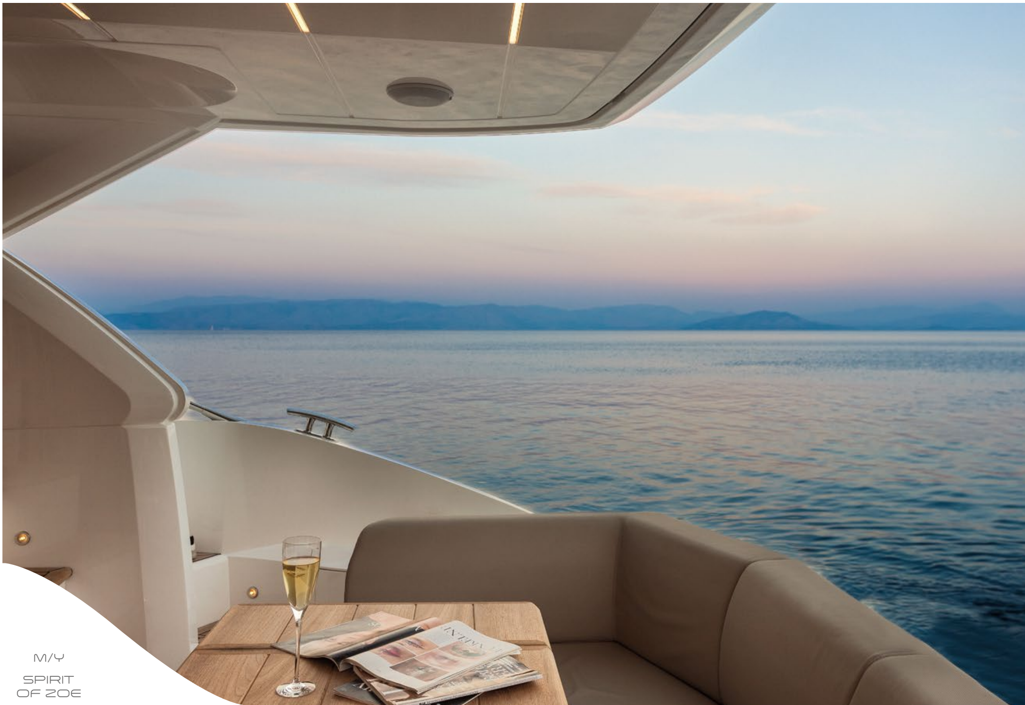
M/Y SPIRIT OF ZOE