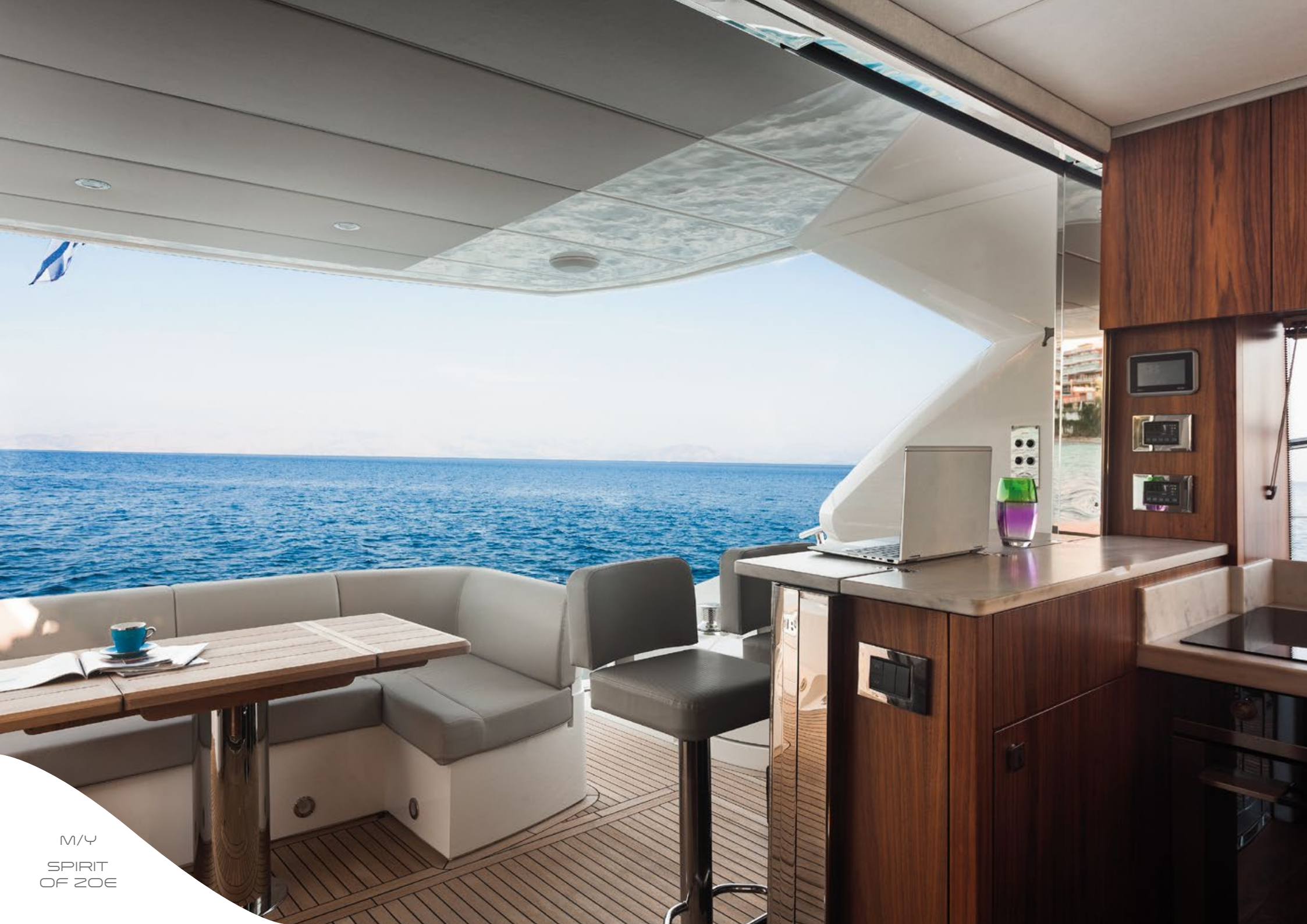
M/Y SPIRIT OF ZOE