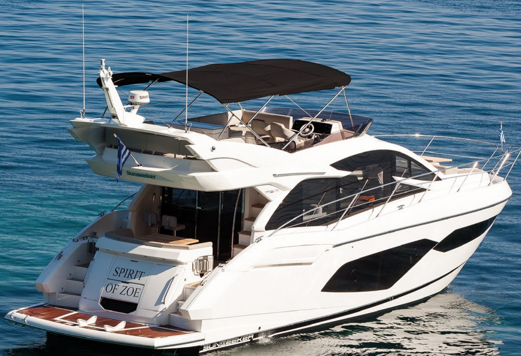
M/Y SPIRIT OF ZOE