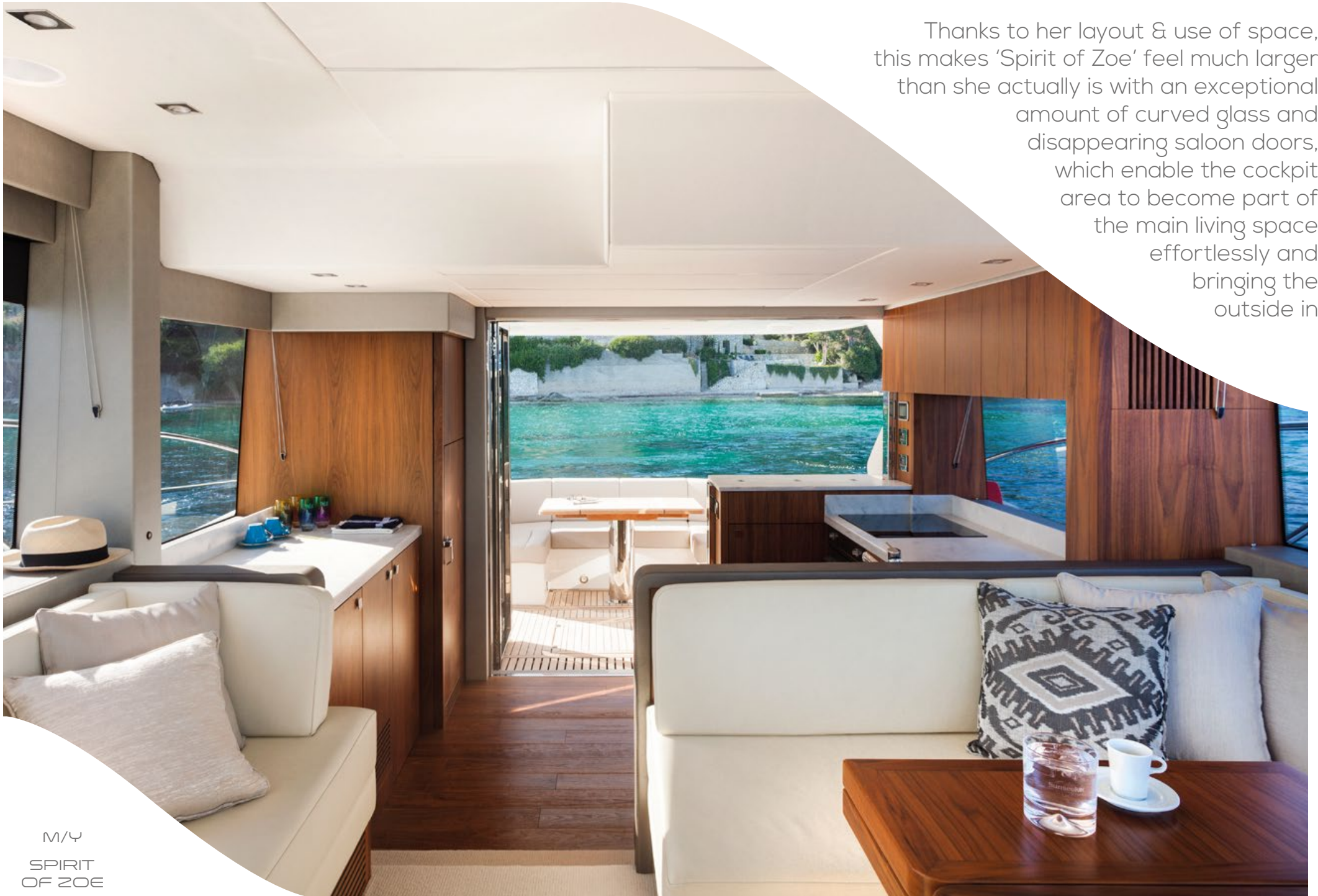
M/Y SPIRIT OF ZOE

Thanks to her layout & use of space, this makes 'Spirit of Zoe' feel much larger than she actually is with an exceptional amount of curved glass and disappearing saloon doors, which enable the cockpit area to become part of the main living space effortlessly and bringing the outside in