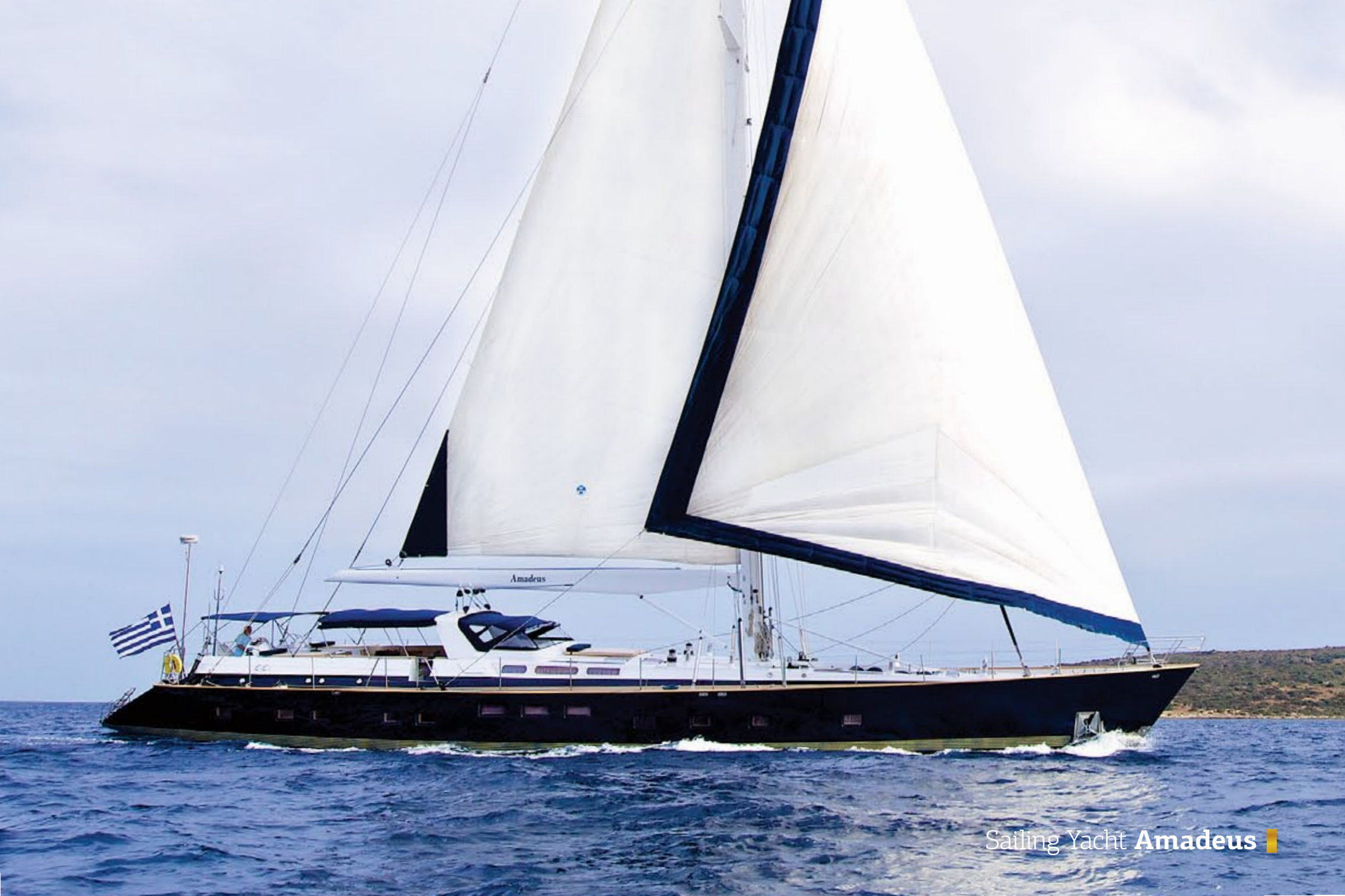
Sailing Yacht Amadeus |